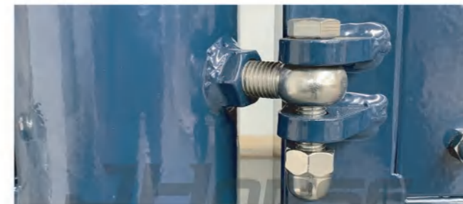
Adjustable Stainless Steel Hinge

High quality adjustable hinges are used on Euro Style fronts or stall doors. They are made of stainless steel for long-term performance and maintenance.