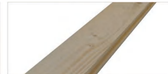
Pine with Groove and Tongue

Durable lumber with groove and tongue not easy to bend or deform available thickness: 25mm, 30mm, 40mm