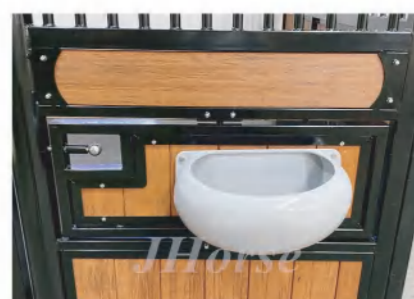
Ⓐ Aluminum Swivel Feeder