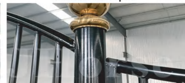
Powder Coating on Galvanized Pipes

Longer life to your stall panels will be ensured through the application of Architectural Grade Powder Coat Finish with UV inhibitors which helps the product resist rust, scratches and fading. The bottom portion of the frame is welded from galvanized steel to provide maximum resistance to rust and corrosion.