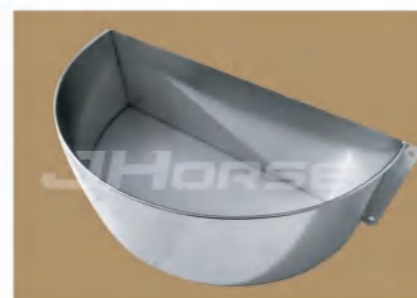
Ⓐ Stainless Steel Swivel Feeder