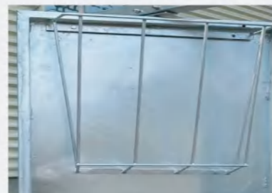
Ⓐ Hanging Hay Rack