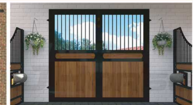
Swing Barn Door