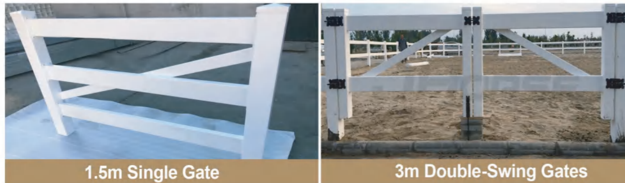
1.5m Single Gate