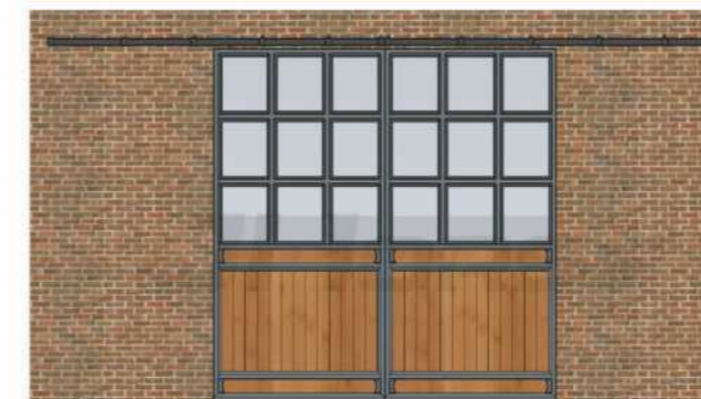
Sliding Barn Door With Glass