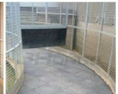
Rubber and Wire mesh