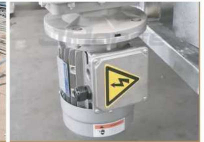
Motor made in Italy