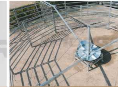
Stainless steel gear box