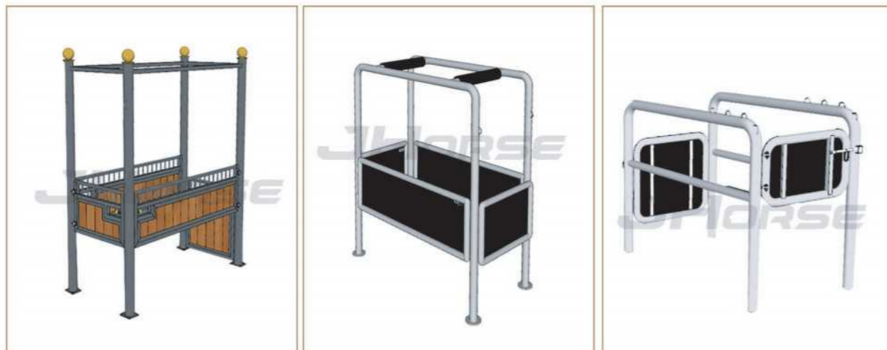
⬆ Euro Style Infill Wood ⬆ High Stock Infill HDPE ⬆ Low Stock Infill HDPE