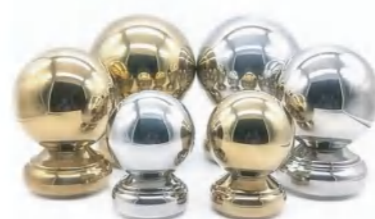
Ⓐ Ball Caps