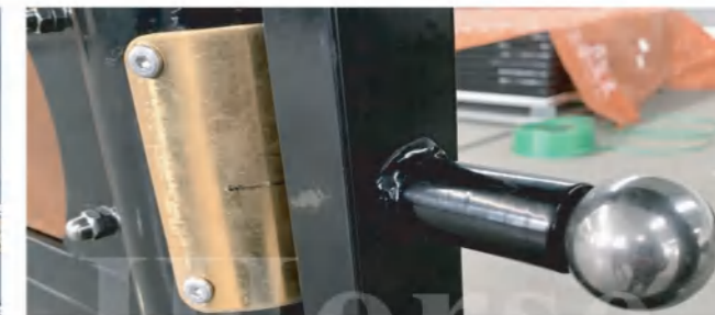
Latch System for Hinged Doors

A Spring loaded plunger latch is applied in Euro-style fronts. It includes a brass striker plate that prevents the plunger from scratching the posts.