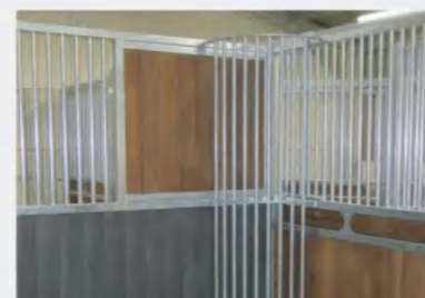
Ⓐ Large Hay Rack