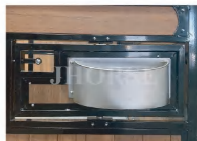
Ⓐ Hot-dip Galvanized Swivel Feeder