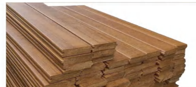
Bamboo with Groove and Tongue

Hardwood with groove and tongue not easy to bend or deform available thickness: 20mm, 28mm, 32mm, 38mm