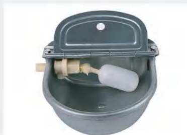
Ⓐ Stainless Steel Water Bowl