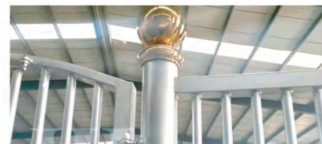
Hot-dip Galvanizing Steel Frame

We recommend hot-dip galvanizing for customers in coastal areas that suffer continuous salt and moisture exposure because it will protect the metal frame well from rust. The welded steel frame will be cleaned and polished before dipped into a bath of molten zinc, which ensures both the smooth surface and super zinc adhesion.