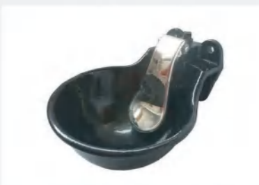
Ⓐ Cast Iron Water Bowl