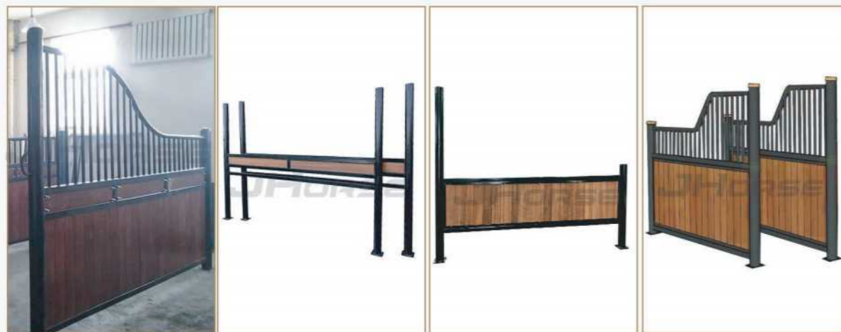
⬆ Classic European Style ⬆ Economical Style ⬆ Simple Style ⬆ Half Board Half Grill