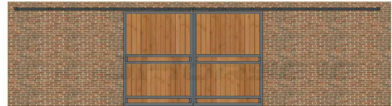
Sliding Barn Door With Full Wood